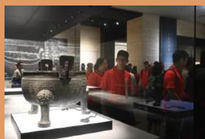
Hubei Provincial Museum

HUST History Museum is a testament to the institution's illustrious past and relentless pursuit of excellence. Housed within its hallowed halls, the museum chronicles the university's evolution from its humble beginnings to a preeminent seat of learning. Visitors are immersed in a journey through time, witnessing key milestones, notable achievements, and the contributions of distinguished alumni and faculty. Interactive exhibits and historical artifacts bring the university's rich heritage to life, inspiring future generations to continue the legacy of innovation and knowledge.