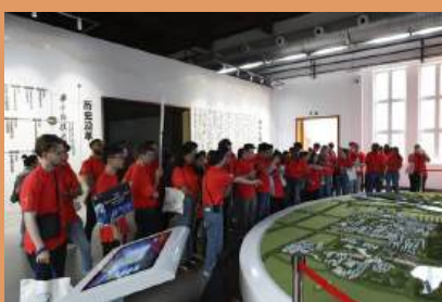
HUST History Museum

HUST History Museum is a testament to the institution's illustrious past and relentless pursuit of excellence. Housed within its hallowed halls, the museum chronicles the university's evolution from its humble beginnings to a preeminent seat of learning. Visitors are immersed in a journey through time, witnessing key milestones, notable achievements, and the contributions of distinguished alumni and faculty. Interactive exhibits and historical artifacts bring the university's rich heritage to life, inspiring future generations to continue the legacy of innovation and knowledge.